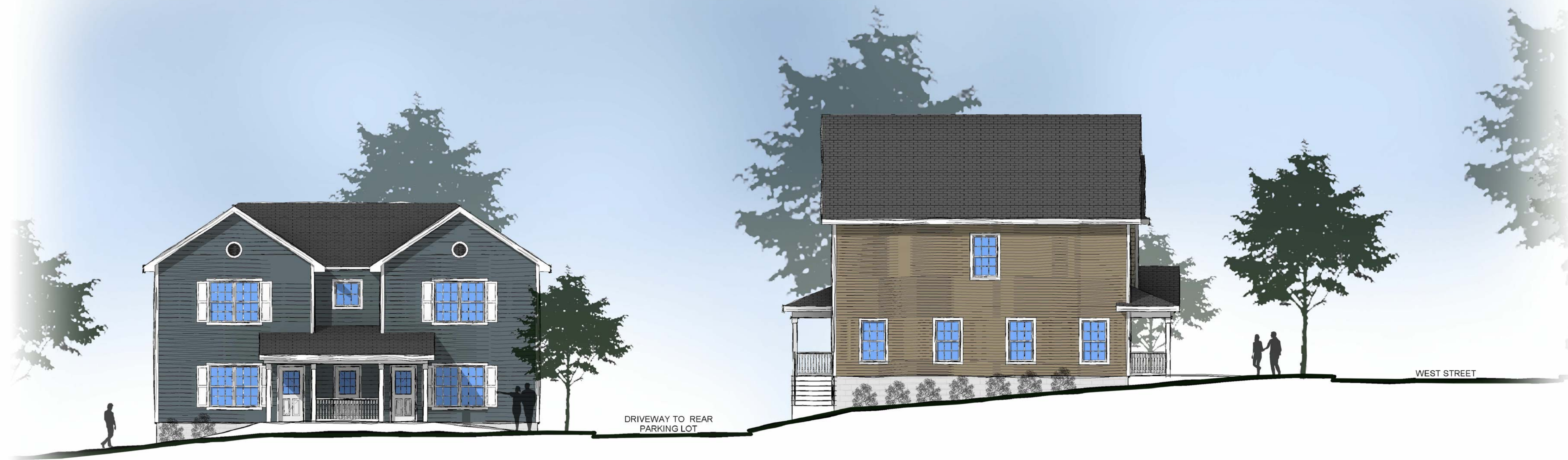
COLUMBIA STREET ELEVATION