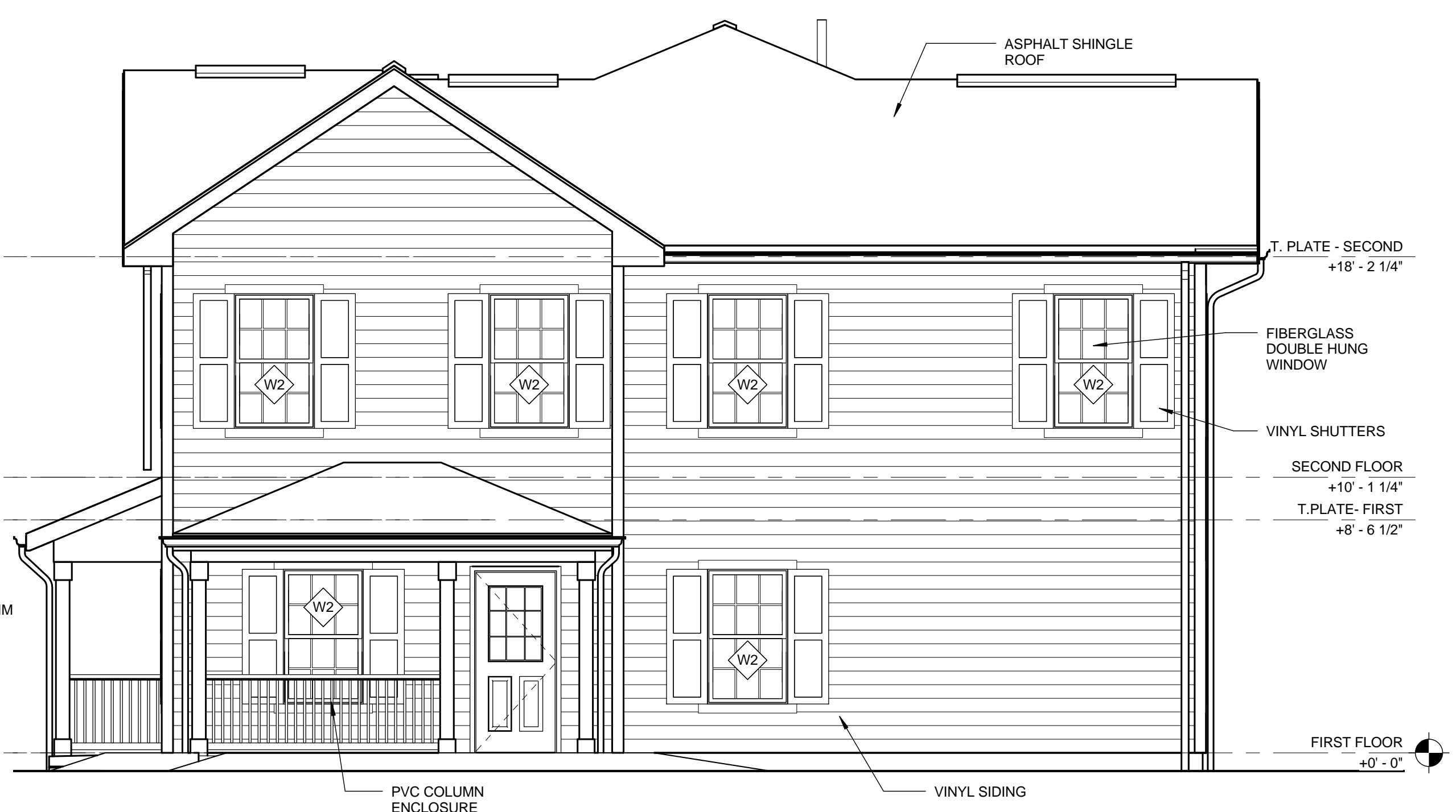
1 EXTERIOR ELEVATION - WEST 1/4" = 1'-0"