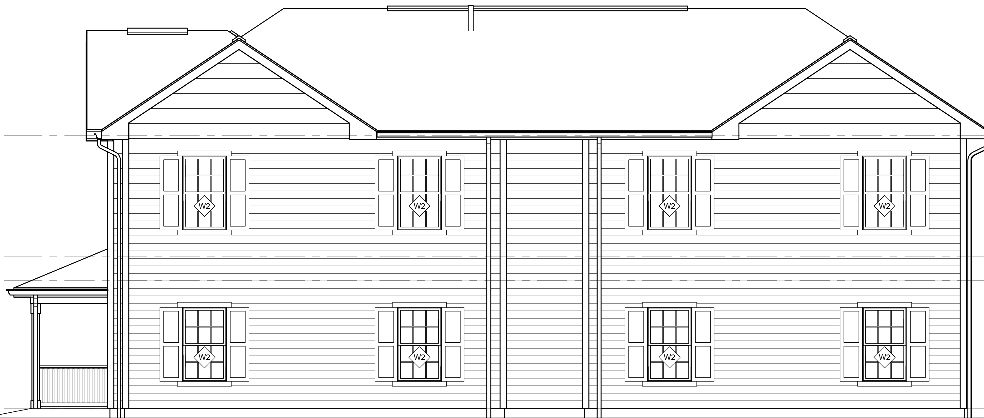
4 EXTERIOR ELEVATION - SOUTH 1/4" = 1'-0"

THESE DOCUMENTS AND ALL THE IDEAS, ARRANGEMENTS, DESIGNS AND PLANS INDICATED THEREON OR PRESENTED THEREBY ARE OWNED BY AND REMAIN THE PROPERTY OF SWBR ARCHITECTURE, ENGINEERING & LANDSCAPE ARCHITECTURE, P.C. AND NO PART THEREOF SHALL BE UTILIZED BY ANY PERSON, FIRM OR CORPORATION FOR ANY PURPOSE WHATSOEVER EXCEPT WITH THE SPECIFIC WRITTEN PERMISSION OF SWBR ARCHITECTURE, ENGINEERING & LANDSCAPE ARCHITECTURE, P.C. ALL RIGHTS RESERVED. ROCHESTER, NEW YORK