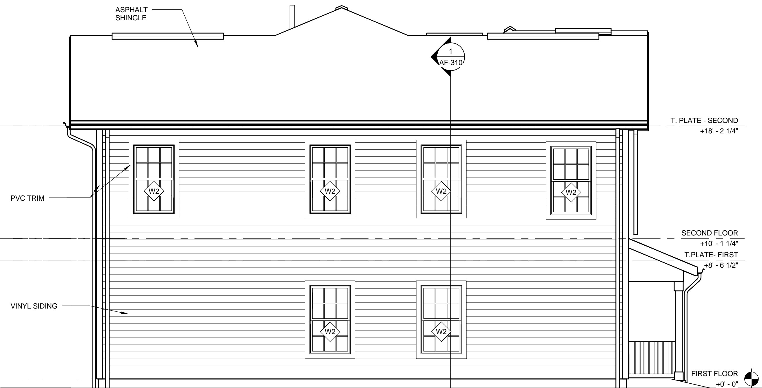
3 EXTERIOR ELEVATION - EAST 1/4" = 1'-0"