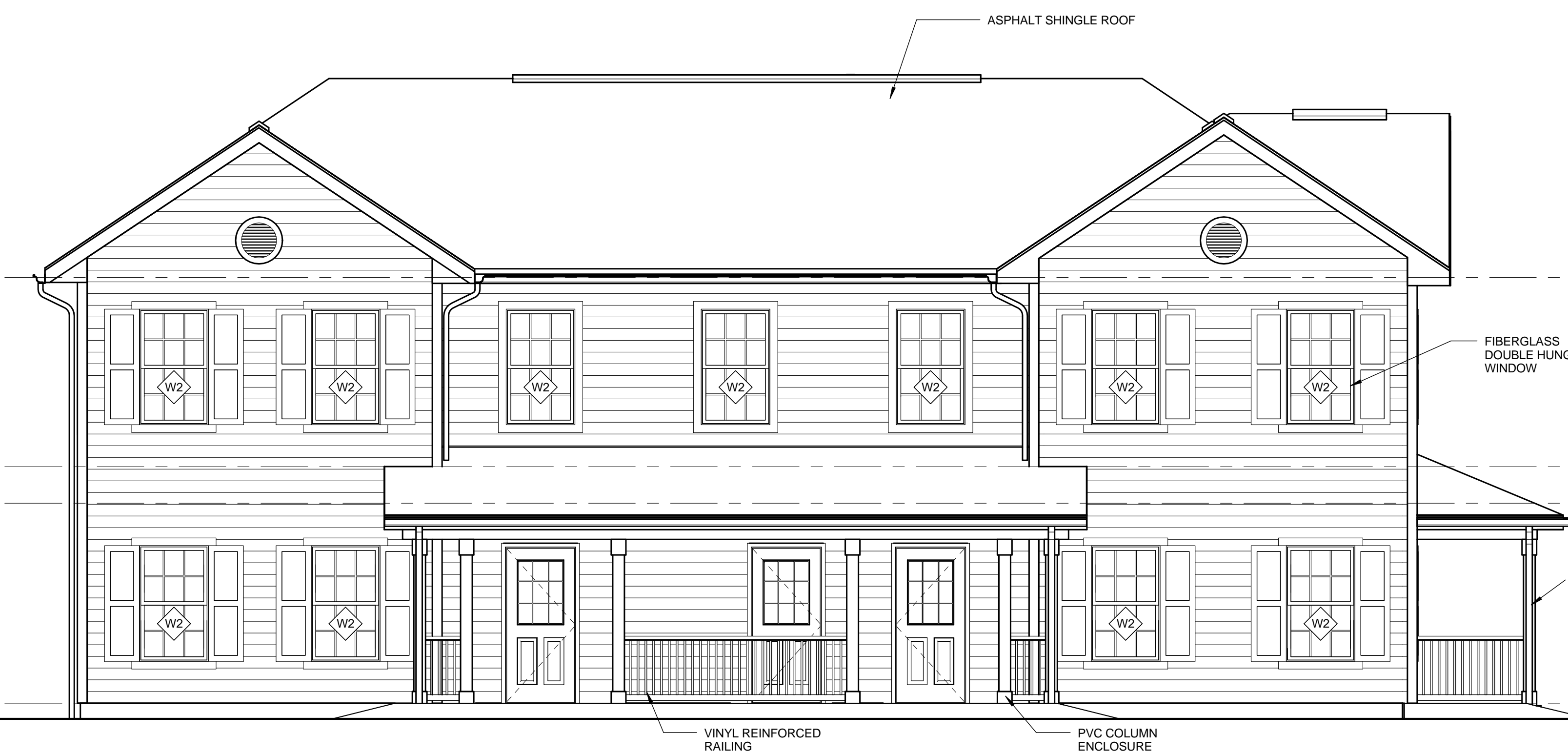
2 EXTERIOR ELEVATION - NORTH 1/4" = 1'-0"